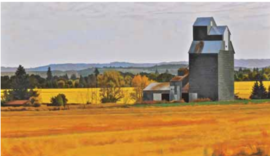
Morning Glow, oil on canvas, 31 x 54"

homemade tools enable techniques not easily accomplished through the use of a single tool, the brush.” ●