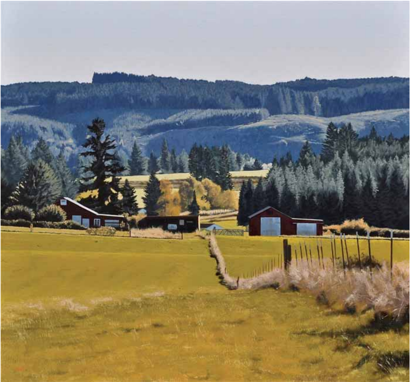
Extra Fence, oil on canvas, 28 x 30"