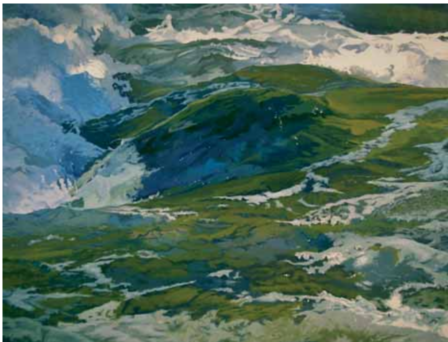
Upswell , oil on canvas, 50 x 66"

"My paintings are views one can see every day. I refrain from reliance on amped-up color or contrived imagery, lighting or paint application," he remarks. "My composition is strong, my colors are fresh and