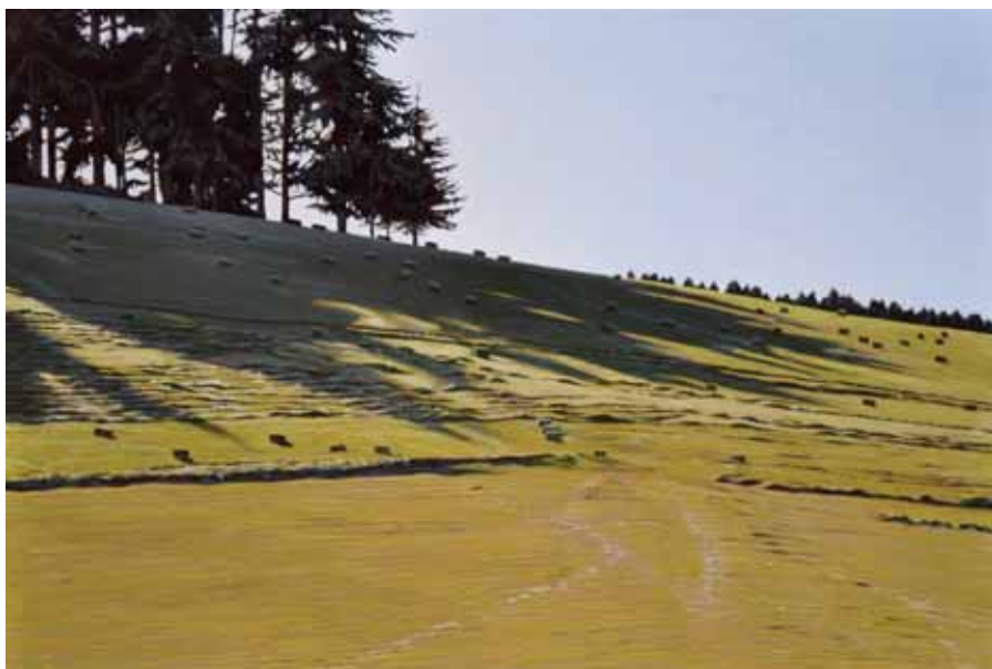
Last Hour , oil on canvas, 20 x 30"