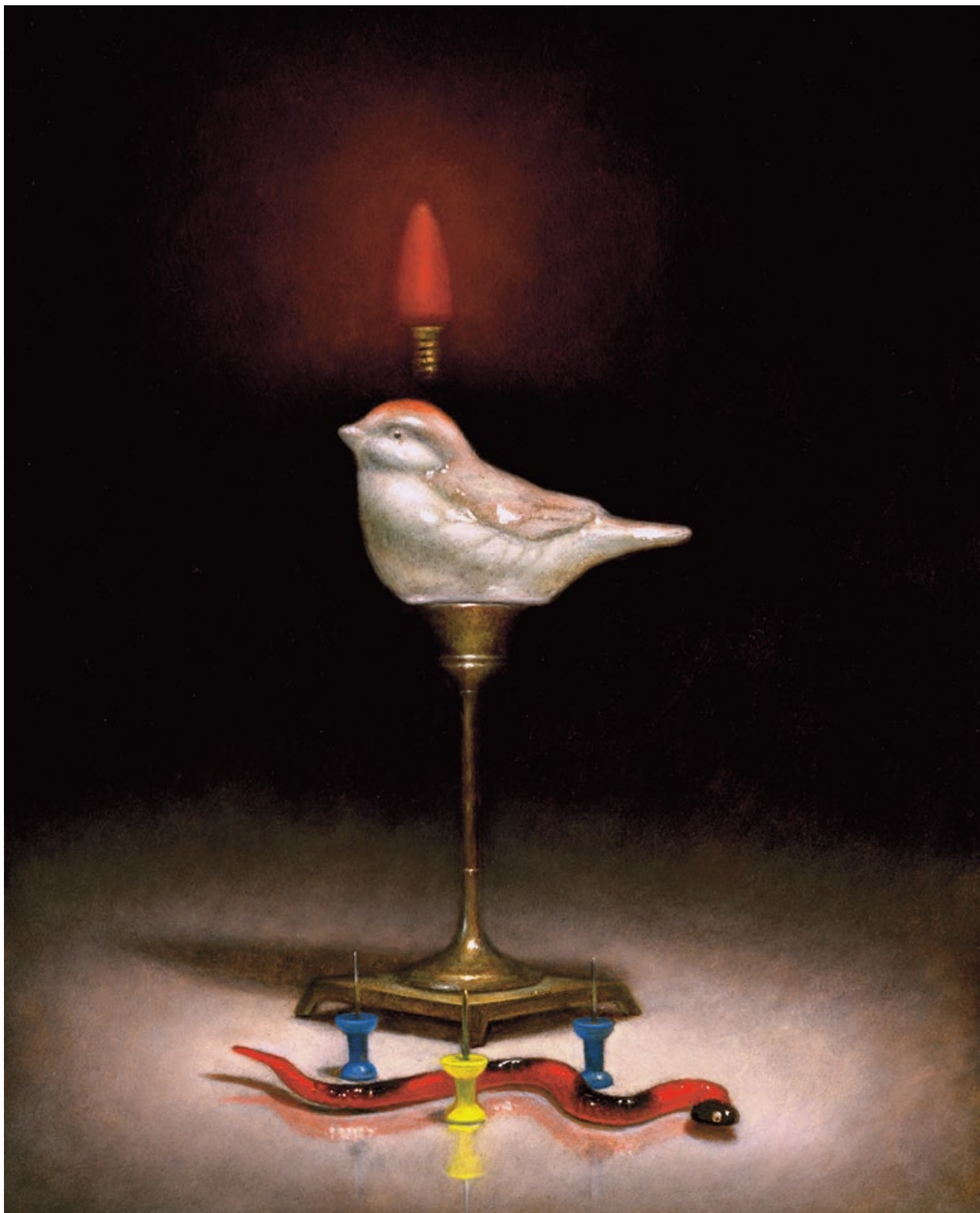
PHILIP R. JACKSON, SNAKE IN THE TACKS, OIL, 10 x 8"