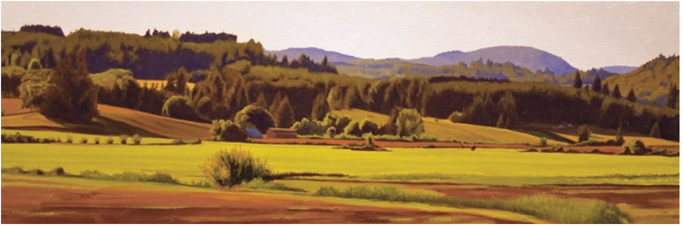
NEAL PHILPOTT, COMING ON, OIL ON CANVAS, 10 X 30"